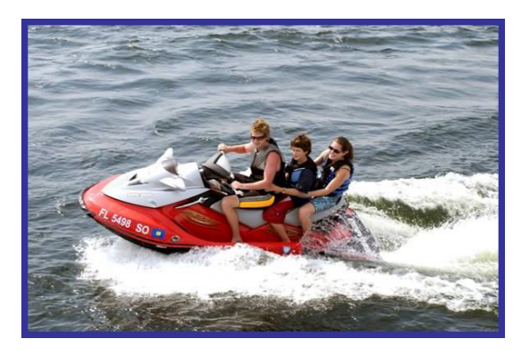
Who May Operate a PWC

A person younger than 14 years old may not operate a PWC legally.